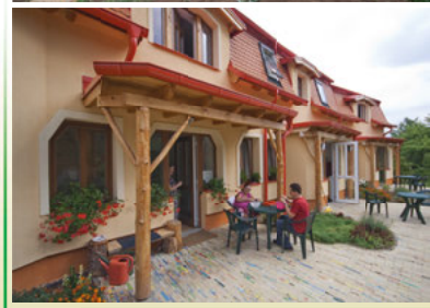
Organic architecture and natural building materials