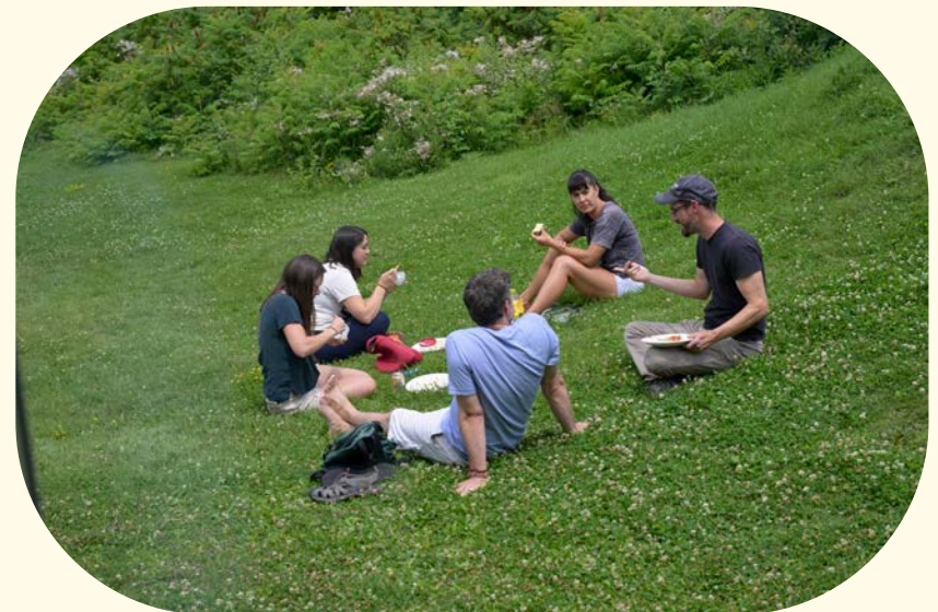
Students on break enjoying the TWS campus