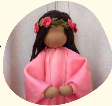
$25 material fee

In creating a silk marionette that is true to ourselves and our life's work we are opening a bridge into our biography. As our marionette lives through our stories, particularly those told outdoors in nature, we open ourselves to the response from nature beings and the possibility for healing and transformation. By the end of the week, your marionette will be ensouled, introduced and active through this unrehearsed, freed form of storytelling. It will accompany you in whatever your work in the world may be.